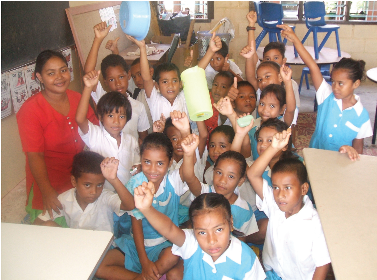
Figure 1: Students of Nauti Primary School in Tuvalu engaged in hand washing as part of their WASH campaign activities

In 2008, WASH campaigns got supported by WSSCC in Tonga and Tuvalu which concentrated in schools especially in the areas of water quality, rainwater harvesting and sanitation and hygiene promotion activities.